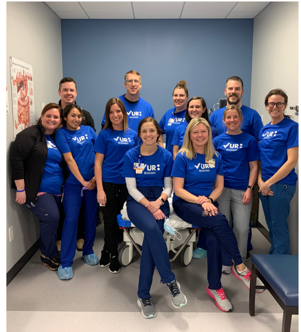
Ohio Gastro team members during Dress in Blue Day for Colorectal Cancer Awareness Month in March 2023.