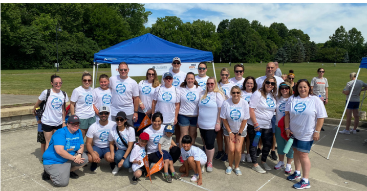
Ohio Gastro team members at the Crohn's & Colitis Foundation Take Steps Walk in 2022.